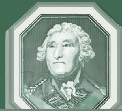
THE GENERAL ELLIOTT